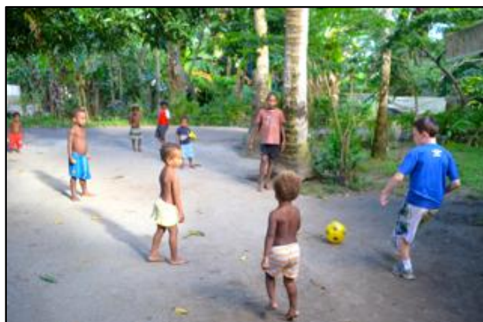
Above: Football - Vanuatu style